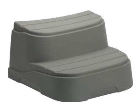
Shown in Taupe