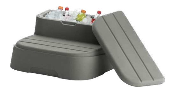
Shown in Taupe

Sport Series: Aspire®, Drift®, Embrace®, Enamor®, Entice®