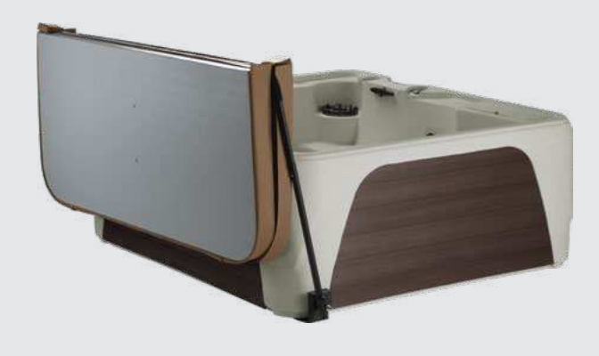
Entice® Premier shown with Sand shell and Brown cabinet with Caramel cover and lifter