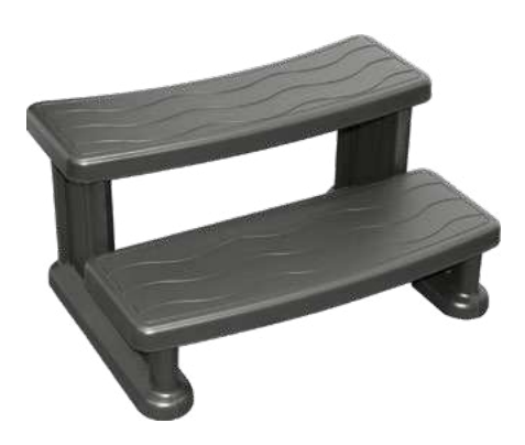
Shown in Charcoal