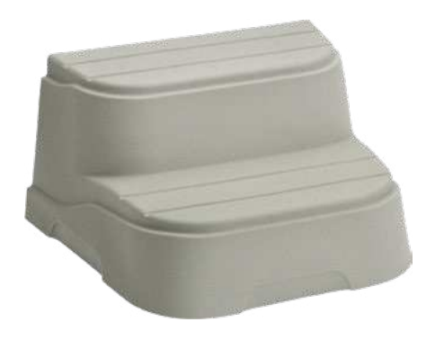
Shown in Sand